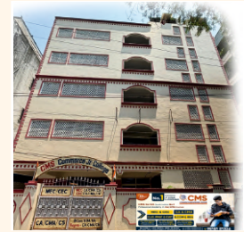
SR NAGAR Boys Campus ☎ 95739 96699