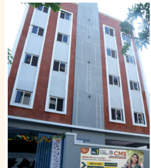
DILSUKHNAGAR ☎ 95739 93399 New Campus