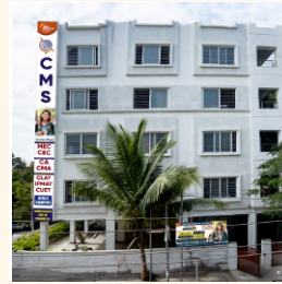
SR NAGAR Girls Campus ☎ 95739 97799