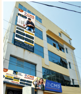
ECIL ☎ 95151 51326