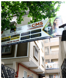
SEC-BAD ☎ 95739 94499