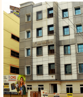
JNTU METRO ☎ 97011 00339