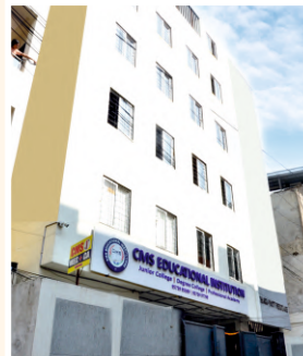
CHIKKADPALLY ☎ 95739 95599