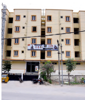
BACHUPALLY ☎ 99639 98669 ( Exclusive Boys Campus )