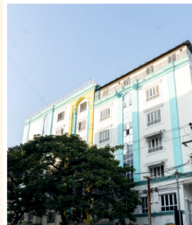
KPHB ☎ 99639 98668 ( Exclusive Girls Campus )